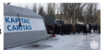
Queuing for support in Ukraine.

Visit caritas.org.au/donate/emergency-appeals/ukraine/ or call 1800 024 413 toll free to provide much needed support.